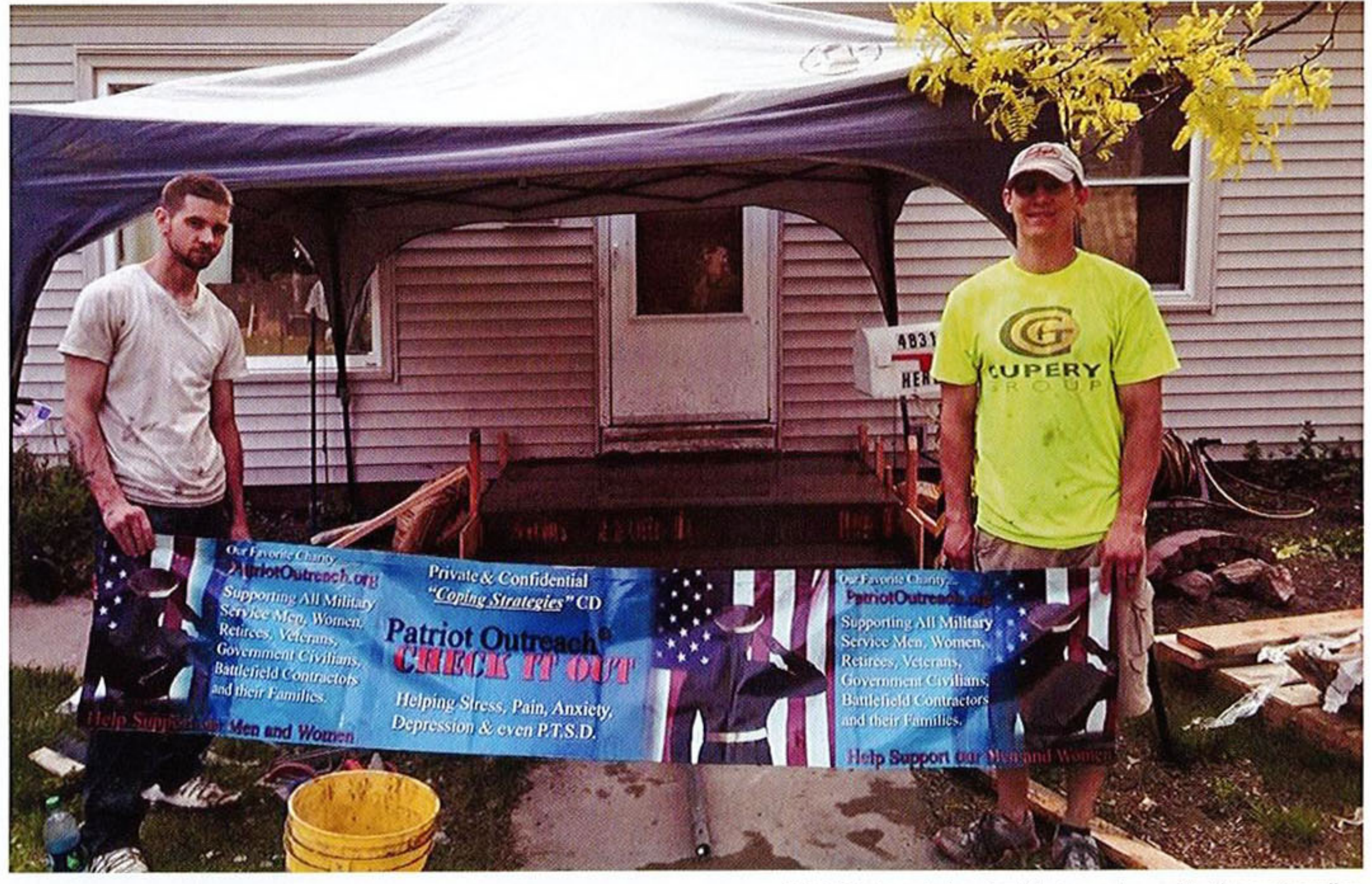
Patriot Outreach does just that, reaches out to those struggling.